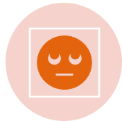
Exhibit early signs of empathy and awareness of others' emotions.

Engage in parallel play, showing interest in playing alongside peers.