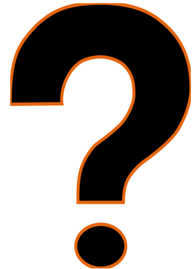
New Team Member