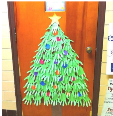
Hand print Christmas tree