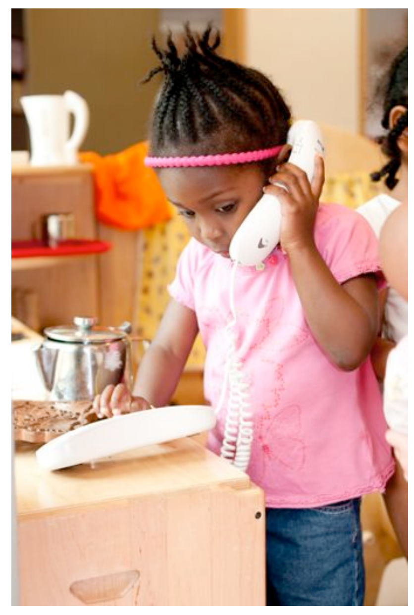
Core Experiences for the EYFS

We do not provide plastic food for the older children, so that they can use their imaginations to transform materials: a ball of playdough can become an orange, for example, and a pan of lentils a stew that is being cooked.