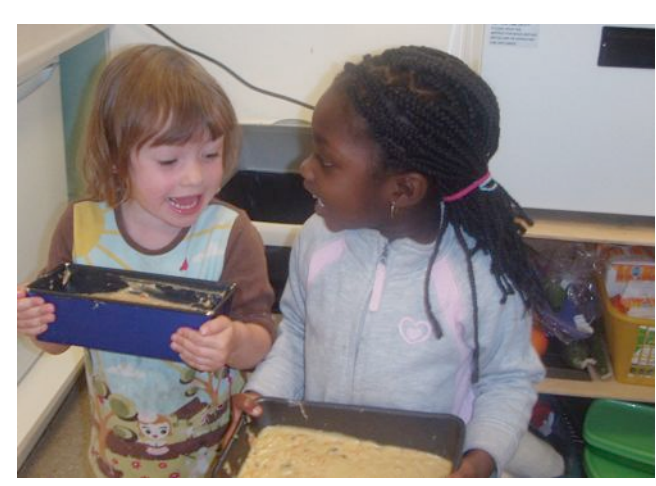
Core Experiences for the EYFS